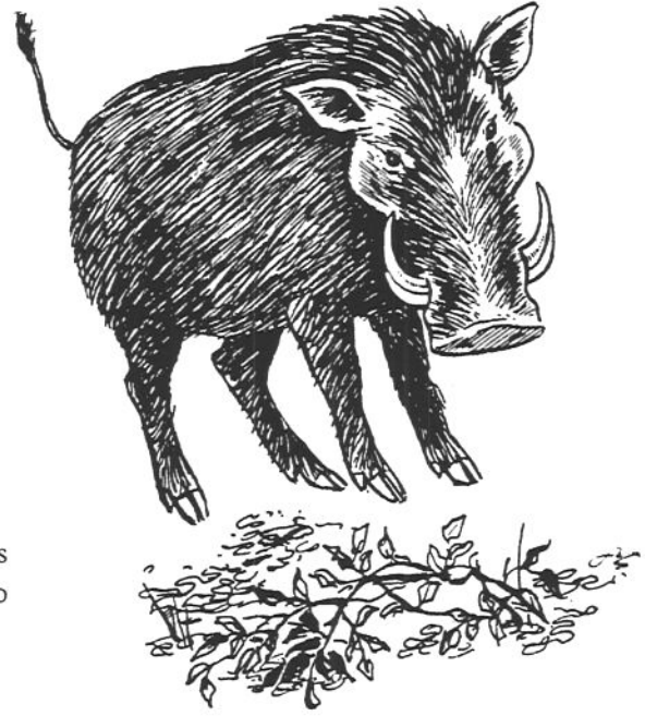
Fig. 3. The Giant Forest-Hog is a forest dweller but comes into the open to raid farms (P 6).