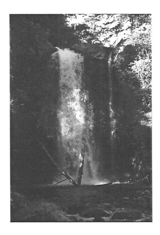
Fig. 4. Logs appearing in a river are a sign of an approaching flood (P 20).

The proverb is applied to a person who is intending to get involved in a quarrel of other people. The proverb functions as a warning to such a person, because mixing in other people's quarrels may be dangerous and harmful. More generally, the proverb is advice to keep away from quarreling people.