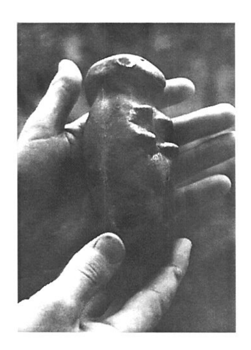
Fig. 7. A small clay figure called nungu is used by some Meru sorcerers to try to harm people (P 29).