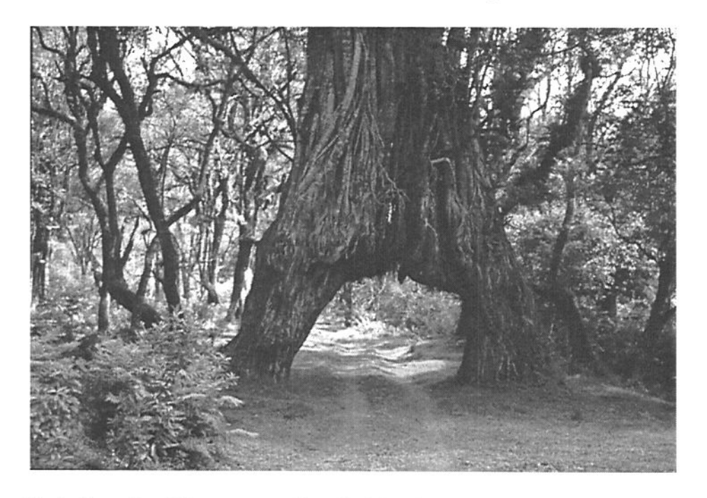
Fig. 5. Even a Land Rover can pass through a big mfumu (P 21).