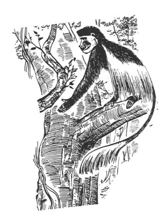
Fig. 6. The black and white Colobus or Guereza lives high up in trees and feeds on leaves (P 26).