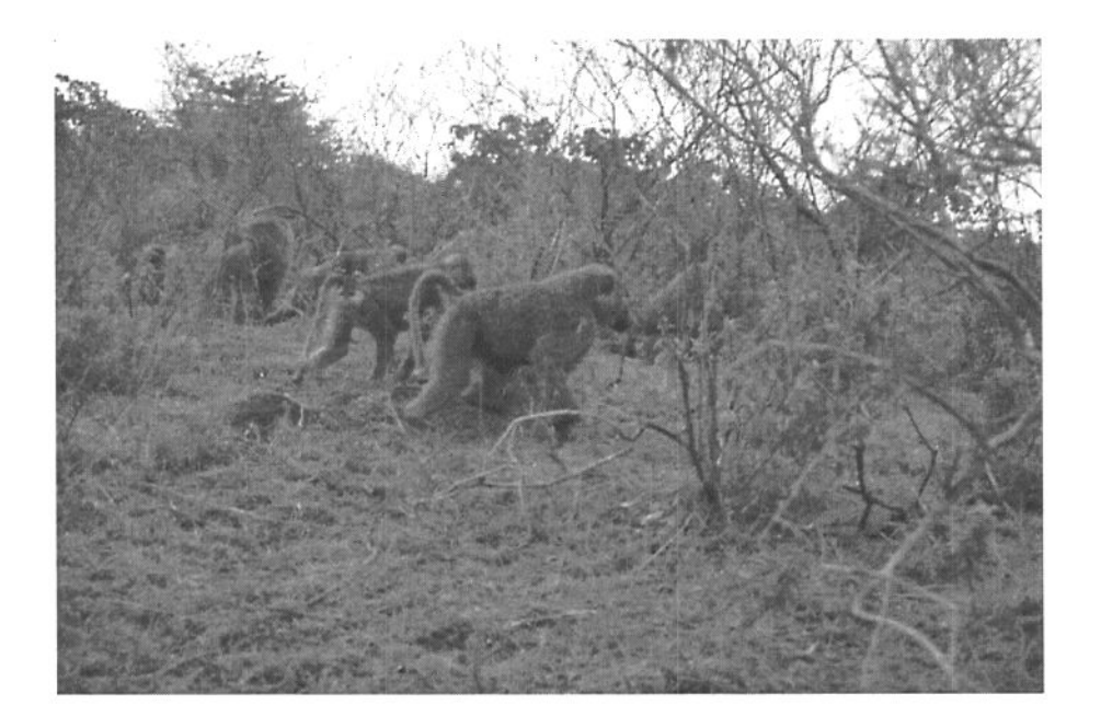
Fig. 18. Baboons are timid but harmful animals (P 95).