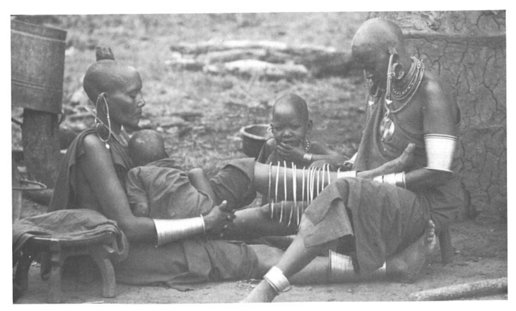
<u>Picture 11.</u> Preparation of women's wire decorations for a ritual. Made of copper, brass or aluminium, these decorations symbolize the Parakuyo women's identity. Without these they do not feel themselves appropriately dressed.

Picture 12. Women have an important past in many rituals. For example, in initiation rituals they dance and sing a number of songs which are in fact prayers to Enkai, the giver of life, fertility and success.