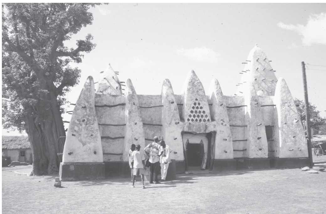
Plate 11. Larabanga Mosque, 1999