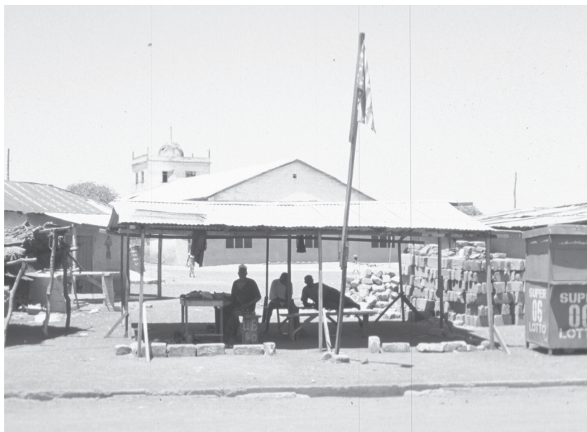
Plate 10. Salaga Central Friday Mosque, 2000; photo: HW.

When compared to the 1911 census, the 1921 census revealed that there was a non-Muslim majority in all the districts of the Southern as well as the Northern Province of the Northern Territories. In fact, the figures of the 1921 census demonstrated that the 1911 census had been pure fiction. Especially in the case of Dagbon, the figures concerning the number of Muslims were now completely different. Whereas the majority of the population of Tamale District in 1911 was said to have been Muslim, ten years later the Muslim population of Western Dagomba District had been reduced to a small minority (7,728 Muslims out of