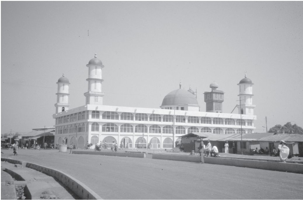
Plate 15b. Tamale Central Friday Mosque, 2000; photo: HW. Visible signs of development and progress or ‘positive change’. The government had started to invest in the infrastructure (during my following visits, the road was finished), the Muslim community had again received some funding to continue the construction of the Central Friday Mosque.

(Islam) could be used as an attempt to unify an opposition to the ruling party and the political order. The crucial question, therefore, was how many the Muslims were throughout the country and, even more important, if there were ethnic groups who already were predominantly Muslim. One southern Muslim political leader, Bankole Awooner-Renner, even argued on the eve of the 1954 election that “... the Muslims formed about 60 % of the police force, about 90 % of the army and about 80 % of the labour force of the country,” 174 clearly an exaggeration but still a critical issue which both the colonial as well as the nationalist leaders, not least Kwame Nkrumah and his Convention Peoples’ Party (CPP), had to take into consideration. Although the politicization of the Muslims ended in a resounding defeat in the 1954 general election, religion remained a political issue throughout the 1950s. By 1958, all parties based on ethnic, religious, or regional affiliations were declared illegal by the Nkrumah government. 175