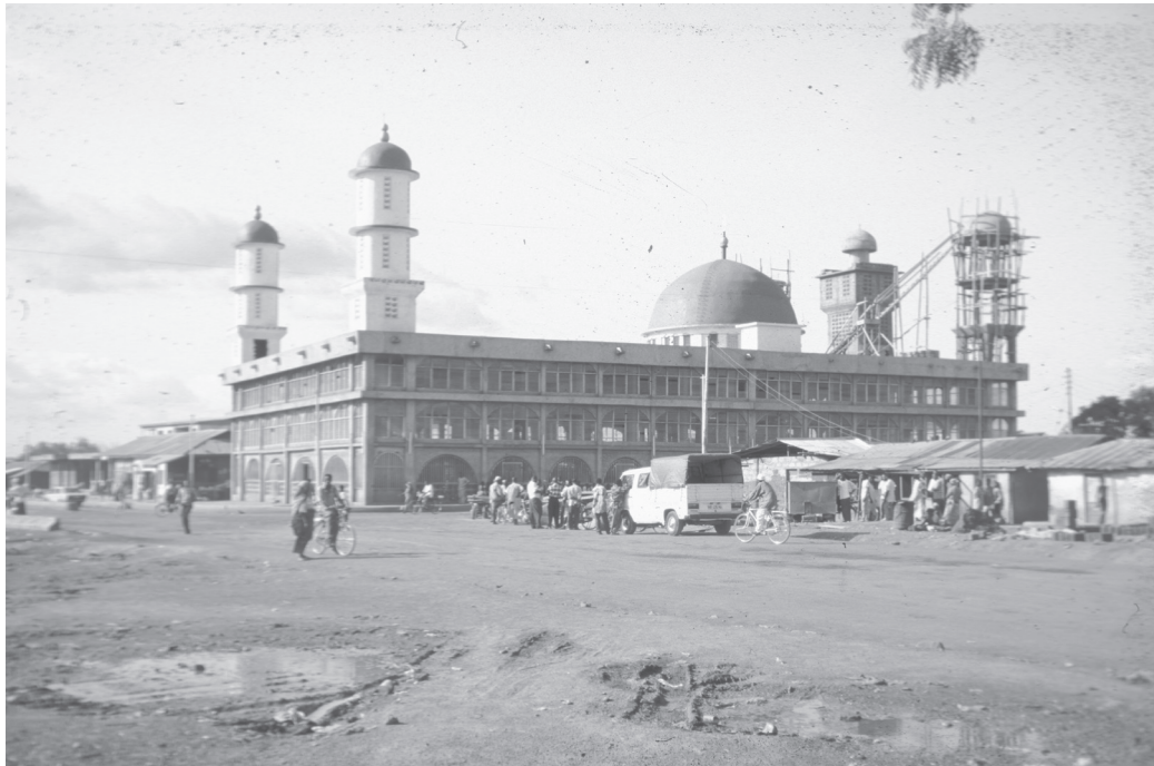
Plate 15a. Tamale Central Friday Mosque, 1999, photo: HW.

among the inhabitants in Dagbon: there was no reference to earlier censuses or to the cause (or causes) for the change. It seems as if the colonial authorities had not recognized the process of Islamization in Dagbon at all. Another possibility was that the religious sphere, whether Christian, Muslim or African Traditional Religion, was not regarded as part of the ‘colonial sphere’ (as long as religious affairs did not jeopardize the colonial peace and economy). What had happened in Yendi (at least) was a remarkable expansion of the ward-mosque system. Whereas there were only a few mosques in Yendi at the beginning of the British period, in 1960 there were already 25 ward-mosques. At the same time, there were some 1,375 compounds in the town, therefore, following Ferguson, there was one ward-mosque for every 55 compounds. On average, the size of the community of a ward-mosque then tended to be between 40–50 men and about 10–15 elderly women. More than anything else, Ferguson’s data clearly highlights the change from the precolonial to the late colonial situation in Dagbon, i.e., the growth of the Muslim population from a minority to constituting the majority of it. 173