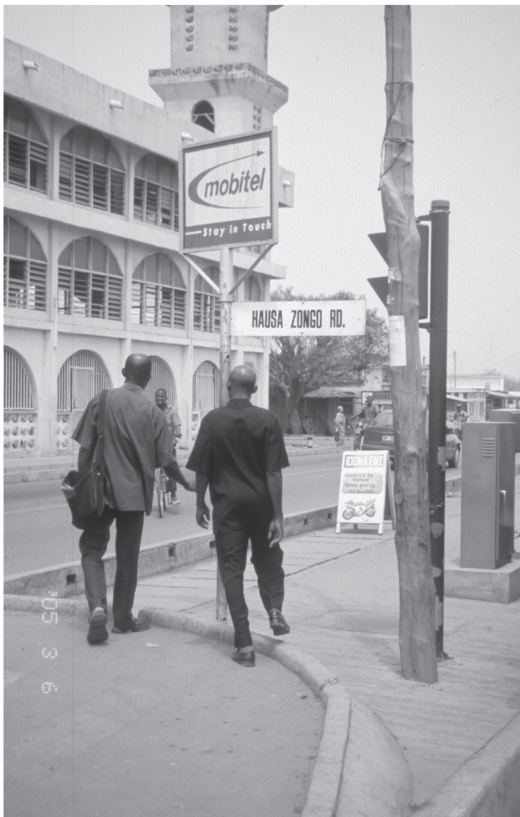
Plate 12. Hausa Zongo Road, Tamale, 2005; photo: HW.

Foreign or ‘alien’ communities were located throughout the Northern Territories, although there was a clear pattern in the geographical distribution of the various groups. The dispersion of the various foreign groups correlated with the historical