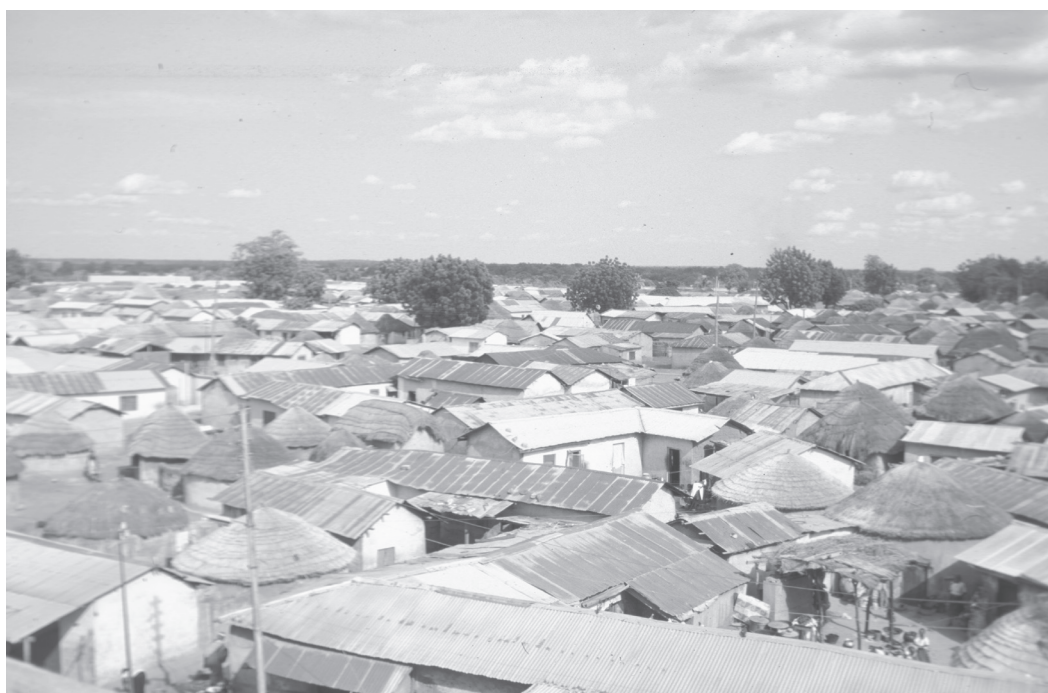
Plate 13. Tamale Old Town, 1999; photo: HW.

The negotiations between the colonial and the Muslim authorities over the terms of celebrating the 'id al-adha or Chimsi-chugu (as the feast is called in Dagbanli) could sometimes be problematic. One major problem was caused by the increasing colonial interference in matters of public sanitation and hygiene. Sanitary reforms were introduced by the colonial government in order to prevent the spread of diseases and promote public sanitary conditions, especially in the urban areas. One consequence of the colonial sanitary reforms, which included the construction of drains, slaughter-slabs and pit latrines, was that the ritual slaughter of animals during the 'id al-adha was to be contested by some colonial sanitary officers during May 1930 at least in Tamale. The problem in Tamale emerged when the Provincial Commissioner of the Southern Province, A.C. Duncan-Johnstone, after having consulted the Medical Officer, granted permission to the Imam of Tamale, the sarkin zongo (Hausa), the sarkin moshi and the sarkin yoruba and their followers to