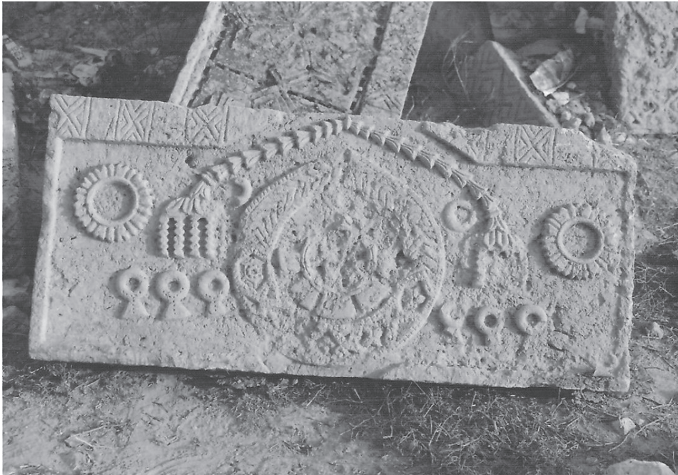
Figure 6. A panel showing various items of jewellery in the necropolis of the Jats

tombs bear weaponry depictions, evidence of the deaths in the battle of Siri of most of those interred there. When tombstones and canopies were erected by their descendents, the motifs of weapons bore testimony to the fact that they were valiant and patriotic warriors who sacrificed their lives while defending their mother land. The jewellery depictions on women's chauhbandis are commonly found in the necropolis of the Jats whereas at Oongar there are only two graves bearing jewellery depictions. One finds inscriptional slabs lying all over the site at the cemetery of the Jats but it is difficult to find any inscriptions at all at the Oongar necropolis since all of the chauhbandis have disintegrated and not a single tombstone is in its original condition.