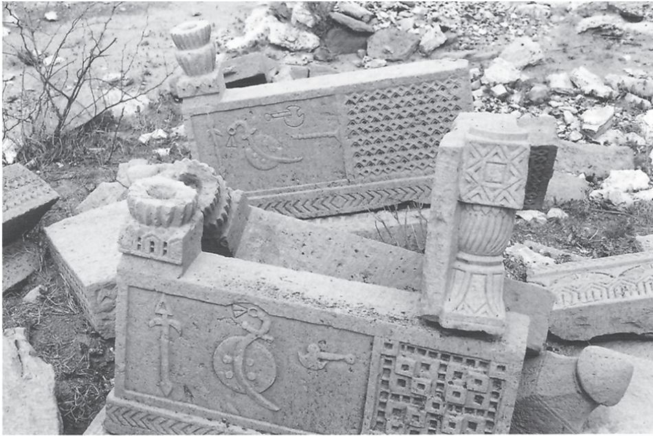
Figure 2. Weaponry depictions on chaukhandi tombs in the necropolis at Oongar