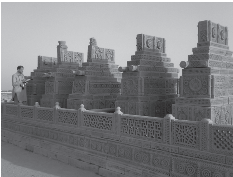
Figure 1. View of tombs at the Chaukhandi necropolis near Karachi, after which tombs of this style may be named