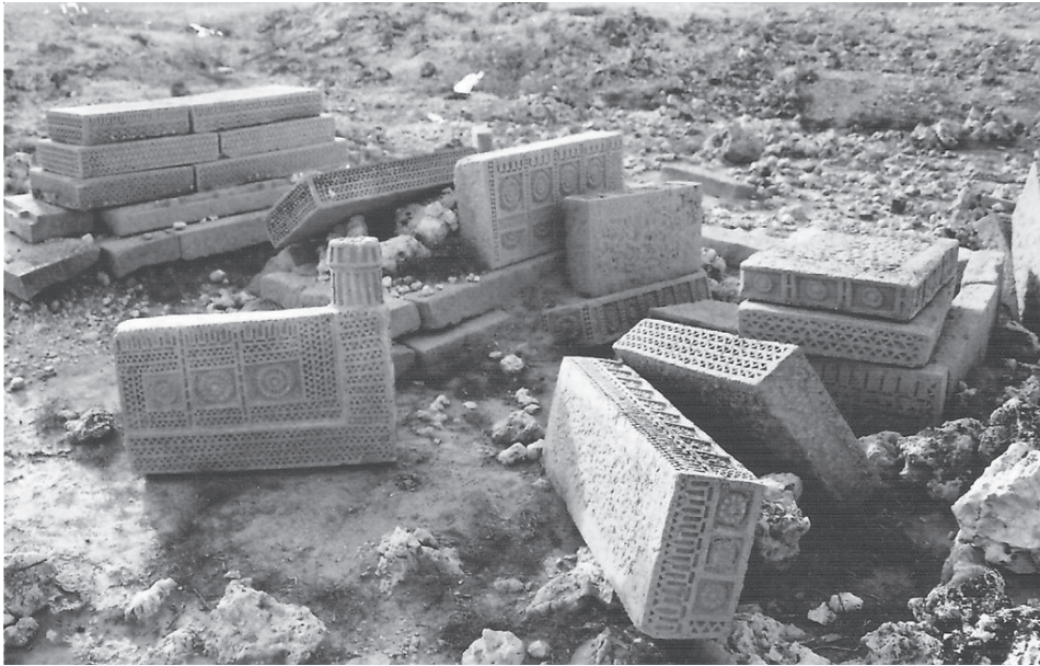
Figure 5. Dilapidated chauhhandi tombs in the necropolis of the Jats

There are more than six chauhhandi tombs which depict jewellery and therefore belong to women. It was the custom among the tribes to bury their men and women in the same necropolis; women were given space near their deceased husbands or sons. There is a variety of jewellery chiselled into the dislodged slabs scattered through the necropolis; for instance, the centre of the panel in Figure 6 is occupied by a necklace. Above this there is the sanghar patti (head ornament with pendants) mostly worn by Jat women; two nose rings are depicted close to the pendants of the sanghar patti and two pairs of bracelets on each side of it; three finger rings appear on each side of the necklace.