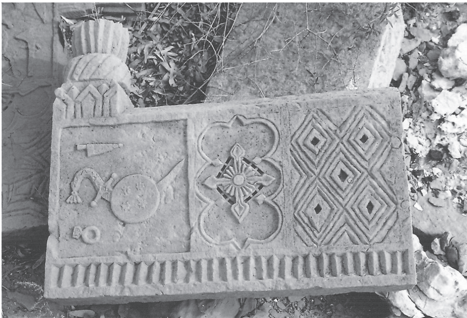
Figure 3. A dislodged gravestone showing a finger ring weapons