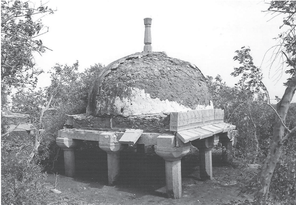
Figure 4. So-called canopy of Darya Khan Burfat