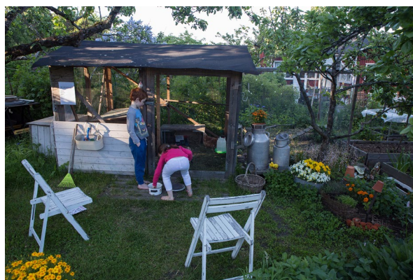
Figure 2 & 3. Photographs from a Hitchhiker's visits to domestic spaces: allotment (left) & home (right).

responsibility for the people with whom they share the journey. Another difference between ethnography and urban hitchhiking concerns the scope of people included in the practice. In certain forms of urban ethnography, the focus is often on the deviants, outcast groups, and minorities (Suttles 1976: 1). Urban hitchhiking does not aim at reaching specific types of people although it is always connected to the particular space where the journey unfolds. Documenting urban hitchhiking experiments allowed Jäntti and Malla understand that the randomness of encounters allowed them to reach a wide spectrum of participants in terms of age, gender, and social status, although they did not specifically target that variety.