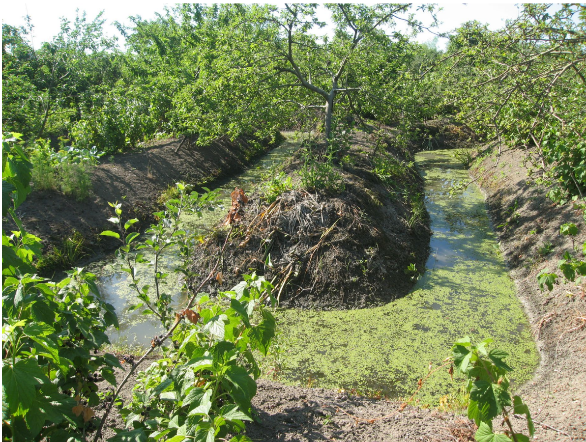
Figure 4: Photo of drainage canals on an Ochakiv Island Garden.

Black Sea water is also a strong presence in residents' lives under certain winds. I was told that the first thing one should learn when living in Vilkoovo is the local names of the winds and their significance because 'we are all dependent on the wind here'. 12 An easterly wind is generally viewed positively—signalled in the phrase 'we are waiting for weather from the sea'—because it facilitates the return of herring to the Kiliia branch to spawn. But an easterly wind can also mean harm when the river is in its high-water phase, particularly when there is ice. During surges, easterly winds press seawater up against discharging river water. This slows the discharge of river water and which can result in the river overflowing its banks, which is what happened