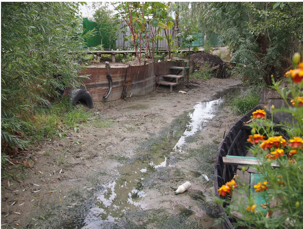
Figure 5: Photo of Gorkii Canal with no water during a westerly wind. It has been renamed Hrushevskii Canal as a result of Ukraine's 2015 decommunization laws.

does not mean that relationships are always harmonious. The movement and settlement of sediments could also generate division and dispute. Because silt was essential for constructing homes and making plots, and was neither deposited every year, nor in equal amounts in all yeriki , people sometimes fought over it. A reed was used to divide the yeriki in half between neighbors on opposite sides of the yerik so that no one took more than what belonged to them. Sometimes disputes came to blows if one person was felt to have taken more than their share. Aksinia Selezneva (born in 1925) explained that her yerik never received a deposition of fresh sediments ( namyv ) because