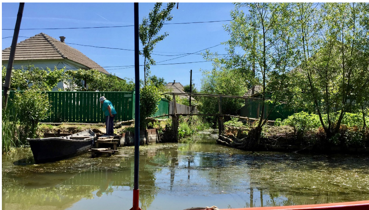
Figure 1: Photo of sidewalks and canals taken during an excursion on Belgorod Channel.

2014). Consequently, development project entrepreneurs (mainly based in the region's capital of Odesa), in collaboration with town administrators, are applying to have Vilково designated as a national and UNESCO heritage site, as a unique example of 18 th and 19 th -century city-planning in a delta environment, while the mayor's office is trying to mobilize funds for a large canal restoration project (Poltorak 2016). However, tourism-development narratives often assume that all residents—called Vilkovchani—can and want to practice 'extraterrestrial life' (ukr. pozazemna zhyttia ), a phrasing coined by a Kyiv-based travel writer that alludes to the alienness of this way of life in the contemporary terracentric Ukrainian national imaginary (cf. Prylypko 2014).