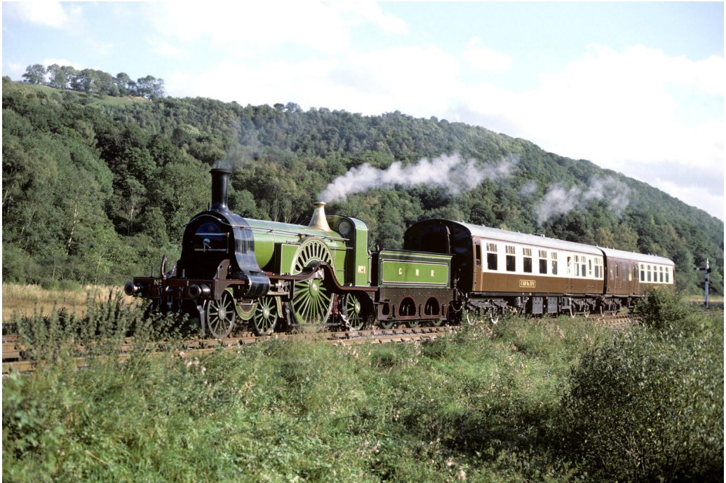
Image 2. Stirling Single No. 1 pulling a heritage service in the 1980s.

part of an event commemorating the centenary year of the LNER 5 and showcasing their improved Flying Scotsman train service. In the early 1980s the locomotive was once again restored to running condition for a limited run of heritage services for the Great Central Railway. Since those specials the locomotive has been preserved as a stationary exhibit as a part of the NRM's collections. In 2014 No. 1 was finally reunited with an appropriate tender and has since appeared aesthetically accurate to its working appearance in the 1890s. Due to its long and eventful history as well as the social and technological changes which took place during the locomotive's lifespan, the Stirling Single No. 1 is an excellent case study for this paper.