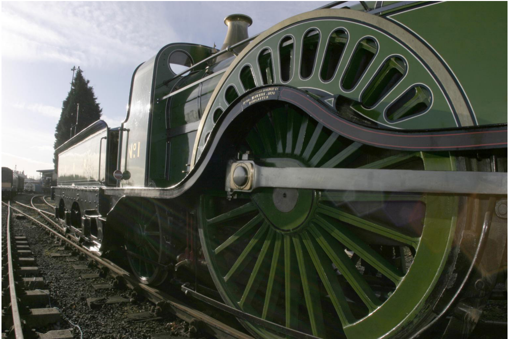
Image 1. The Stirling Single No. 1 outside the National Railway Museum in 2008, coupled with an incorrect tender. A correct tender was finally coupled to the Stirling Single in 2014.

Museum (henceforth referred to as the NRM) in York. 4 Research and archival staff were consulted to ensure the accuracy of the following information as the author was unable to visit the NRM in person due to the global coronavirus pandemic.