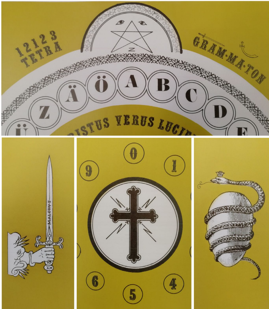
Figure 2. The pentagram, the sword, the cross and the Orphic Egg.

The Latin proverbs printed inside the Yhteyslauta's alphabet circle were central tenets of Siitoin's (1973, 145; 1974a, 182) occultist philosophy. These principles, defined as 'divine wisdoms' in the manual, were adopted from Rudolf Steiner's (1908/1993) and H. P. Blavatsky's (1888/1893) works. According to Steiner (1908/1993, 130) the first phrase, ' Christus verus Luciferus ' (Christ is the true Lucifer), refers to Christ as the light-bringer, who brought independence to humanity. Luciferic beings attempted to do the same, but humanity was insufficiently mature before it was unified by Christ through