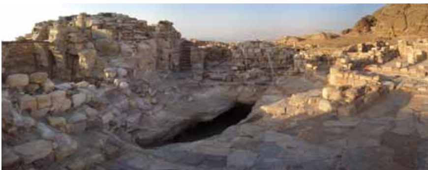
Figure 5. A view of the natural fissure-cum-cistern, which forms the focal point of both the Nabataean temple and the Byzantine ecclesiastic complex. The Western Building is on the left side of the image, the church and the summit of Jabal Haroun are on the right.