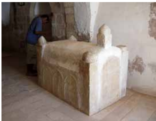
Figure 2. The cenotaph of Aaron (Haroun) inside the weli bears evidence of the long history of religious observance related to Aaron. Built partly of reused marble chancel screen posts from the Early Byzantine shrine, it is covered with Hebrew inscriptions left by Jewish pilgrims. The Arabic inscription in the central panel in the front records the building of the grave monument by Emir Seif-ed-Din in the fourteenth century CE.

struck, moreover, by a disastrous earthquake in 363 CE, which left many of the temples and other monumental structures permanently in ruins. The city was long thought to have been abandoned soon after the earthquake. The general scarcity in Byzantine sources of historical references to Petra has further added to the romantic mystery surrounding the Nabataeans. Recent archaeological excavations, however, have shown that Petra survived the disaster of 363, and was in fact able to recover to the extent that in the sixth century the city boasted several churches adorned with mosaics and marble decorations (e.g. Fiema et al. 2001; Fiema 2002, 2008).