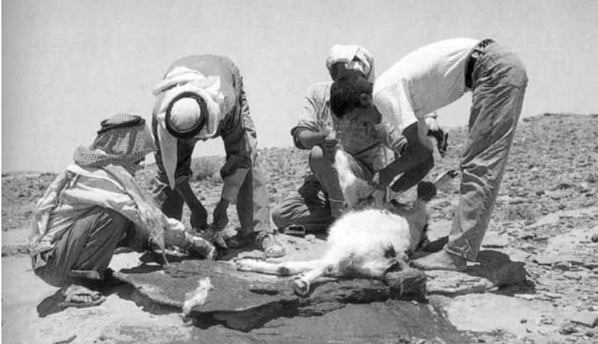
Figure 6. Goat sacrifice on top of the ruins of the monastery in the beginning of the first FJHP field season (1998).

carried by a virgin in a procession of women that went around a village or camp, visiting local shrines and singing special songs for the ritual (Figure 7). The ritual as such was not limited to the region of Petra or Wadi Mūsā, but in the vicinity of Petra it was associated with the cult of Haroun. Local women traditionally did not climb all the way up the mountain, but gathered at a place from which the mountain could be seen. Today the association