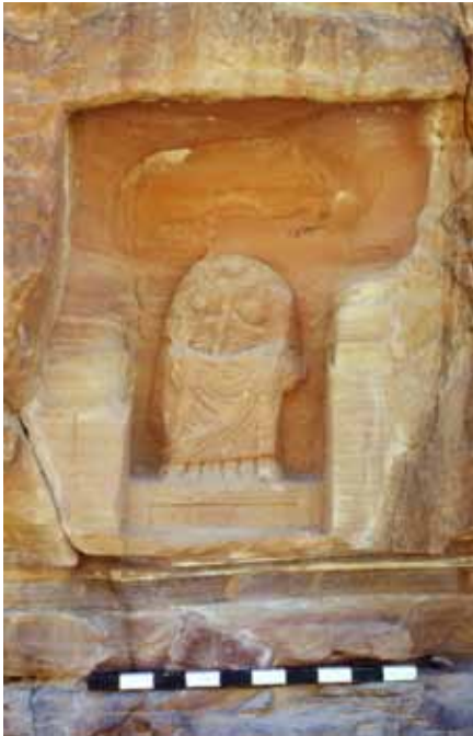
Figure 8. The 'Isis niche' of Wadi Abū Ollēqah, located along the road from central Petra to Jabal Haroun. Scale 1 meter.

Notably, the association of the mountain in recent folklore with crop fertility and the mysterious 'Mother of Rain', as discussed above, would fit well with the interpretation featuring Isis as the 'deity of Jabal Haroun'. In Egyptian mythology, Isis represents the fertile banks of the River Nile, which in