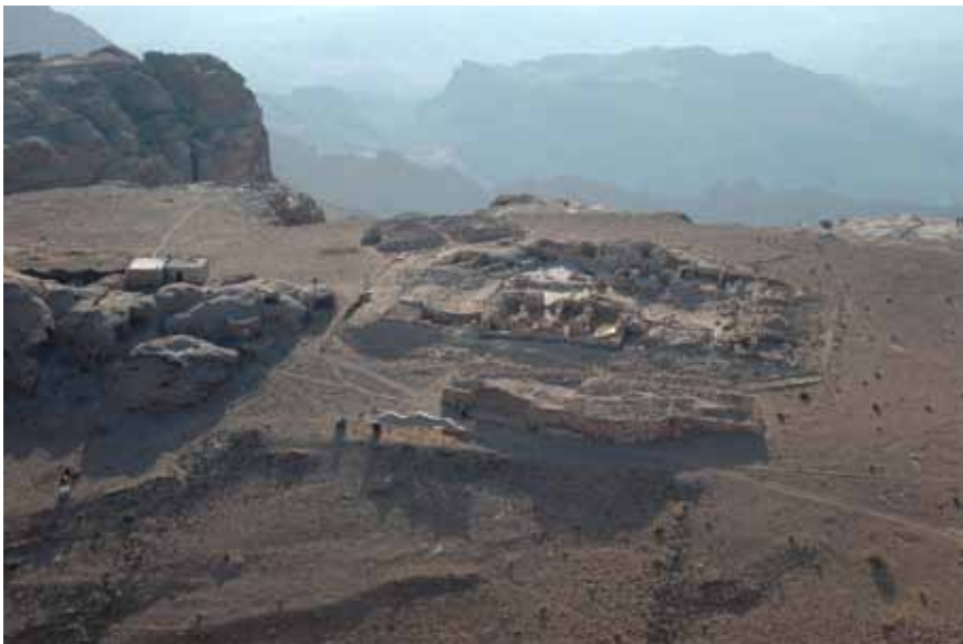
Figure 3. A view of the FJHP excavation site (in 2007) from the summit of the mountain.

The purpose of this paper is to explore one significant aspect of the site, i.e. the literary, archaeological and ethnographic evidence for the long-term continuity of sacred significance of Jabal Haroun. The FJHP excavations as