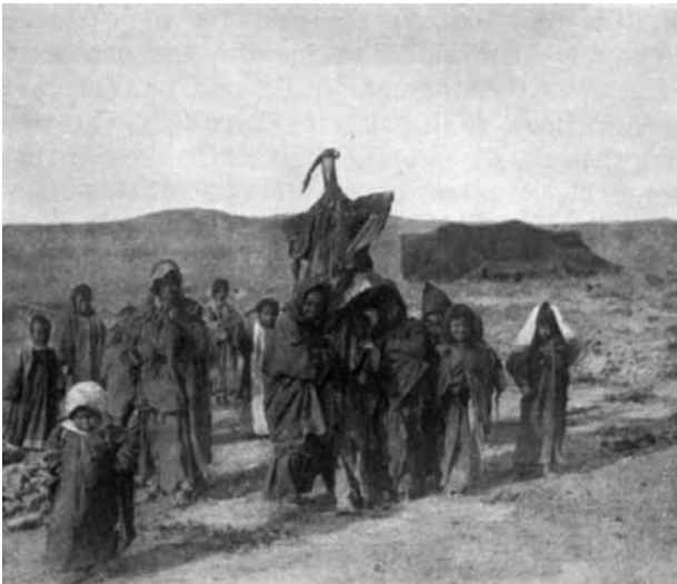
Figure 7. An early-twentieth-century procession of the 'Rain Mother' among the Rwala Bedouin in the Syrian Desert. From Musil (1928, 13).

carried by a virgin in a procession of women that went around a village or camp, visiting local shrines and singing special songs for the ritual (Figure 7). The ritual as such was not limited to the region of Petra or Wadi Mūsā, but in the vicinity of Petra it was associated with the cult of Haroun. Local women traditionally did not climb all the way up the mountain, but gathered at a place from which the mountain could be seen. Today the association