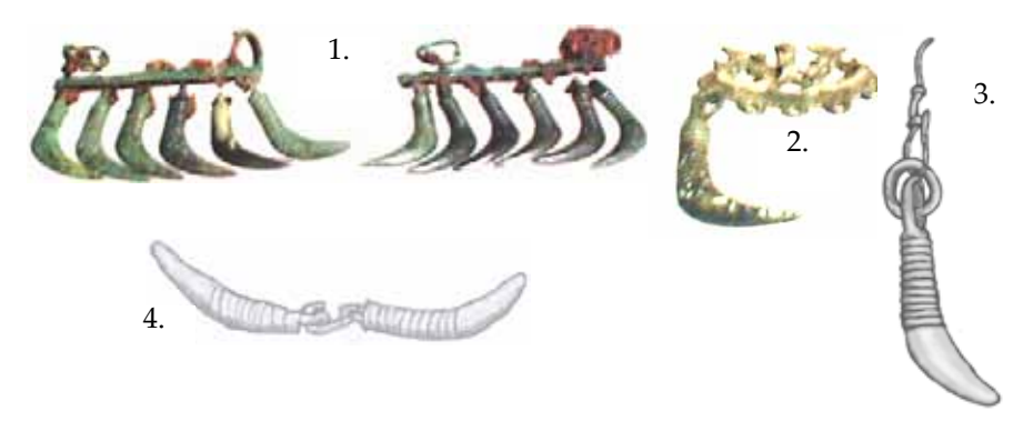
Figure 1. Use of bronze-tooth pendants in a costume. (1) Bronze pendants as a set on the waist have been found at the Kirkkomäki cemetery in Turku. (2) A single pendant attached to a chain holder (Turku, Kirkkomäki). (3) A bear-tooth pendant on a chain. Another example of a single pendant in a chain arrangement on the breast has been found in an inhumation grave in Kalvola, Häme. One pendant was also placed in the double grave of a man and a woman (Masku, Humikkala). (4) Two pendants joined together (Lieto, Merola). (Kivisalo 2006.)

(2005) has suggested three possible forms of communication in the Baltic Sea area. The first is the professional sphere of contacts among merchants and missionaries; second, the sphere of local and strategic contacts; and finally the sphere of deep traditions and extended kinship. These aspects of communication have to be taken into consideration in accounting for the occurrence of bronze bear-tooth pendants in both areas.