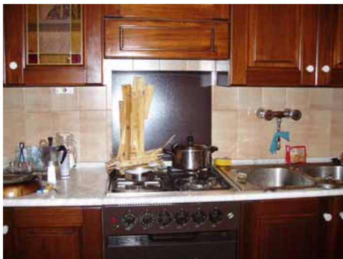
Figure 6: Lydia drying wood slats on the gas oven collected from the bin in the kitchen. Modern technology aids making the fire (IR, May 23, 2008).

some of the participants had gone to particular trouble to get firewood for the ritual. One participant reports having seen Lydia chopping firewood in the rain like one of the seven dwarves. Including the Blankas, there were seven of us at the retreat. The healer adds that the picture of Mary on the mantelpiece is akin to Snow White (Notes May 21, 2008). This is an illustrative comparison because much as Snow White guides the dwarves, Mary is present as an agent (IR, May 21, 2008).