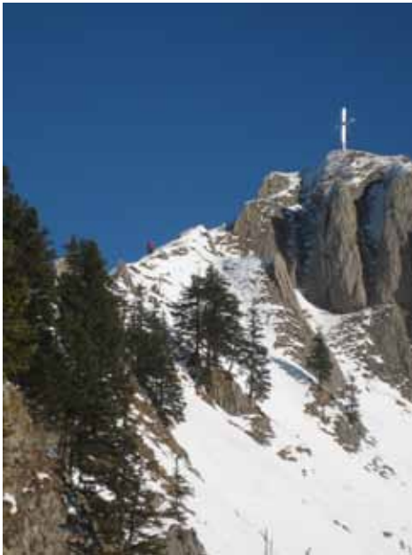
Figure 2: Mount Tegelberg and the cross at the top. The red coat of the interviewee is visible against the blue sky as she descends (IR, December 29, 2008).