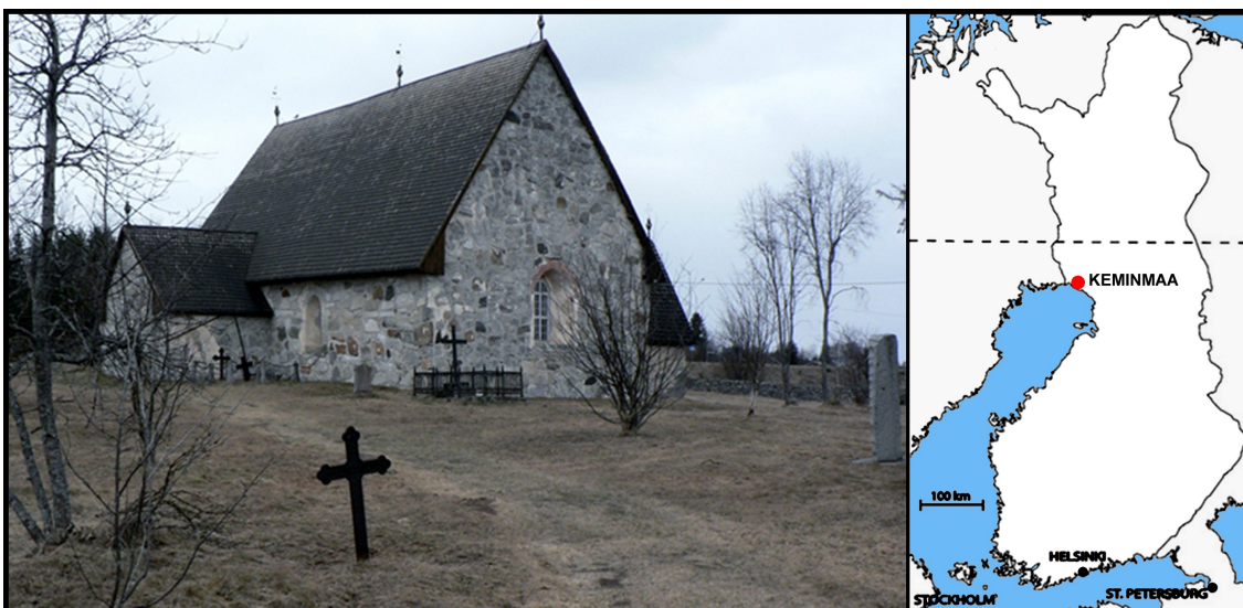
Figure 1. The old stone church of Keminmaa was built in the early 16th century. It is located in the delta of Kemi River in Keminmaa, Finnish Lapland. In summer time the mummified remains are still exhibited to tourists in the church. Photo: Tiina Väre, 2011.

As a consequence of this practice, some of the deceased ended up in cool, ventilated environments that preserved their soft tissues (Paavola 1998, 148; Núñez, Paavola and García-Guixe 2008). Due to this there still are mummified human remains in several old Finnish churches built prior to the late 18th century. In the old Keminmaa Church in Finnish Lapland (Figure 1) such conditions led to the natural mummification of the remains of a late vicar of Kemi (now Keminmaa), Nikolaus Rungius (ca.1560–1629). These remains are probably the most famous example of natural mummification in Finland, although even in the same church there are also more perfectly preserved remains.