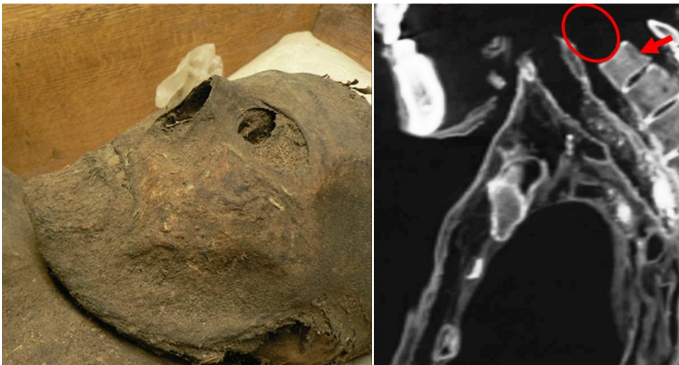
Figure 3. The computed tomography imaging conducted on the remains revealed six cervical vertebrae to be missing (red circle) above the seventh which is indicated by a red arrow. Already the external appearance is peculiar as the head is resting directly above the rib cage.