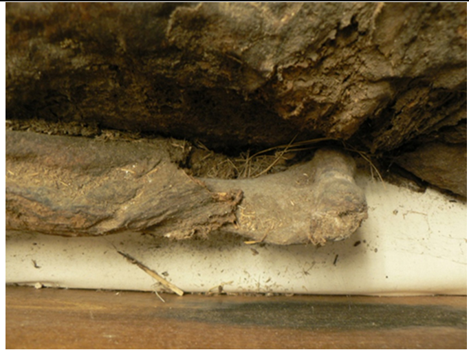
Figure 2. The mummy of Vicar Rungius no longer has its right forearm. Although several stories explain what happened, the actual cause of the damage ripping off the tissues of the forearm and leaving the proximal end of his right humerus bare is unknown.

The computed tomography (CT) imaging of Vicar Rungius’ remains conducted in the spring 2011 revealed the loss of six cervical vertebrae (C1–C6) (Niinimäki et al. 2011; Väre et al. 2011; Figure 3). This led to suspicions of also the head having become fully detached from the rest of the body at some point. The mummified tissue is relatively frail, and it is possible that both the forearm and the neck have damaged while lifting and moving the mummy to a new coffin, which is something that undoubtedly has taken place several times during the past three centuries (Itkonen 1976, 20; Kallinen 1990).