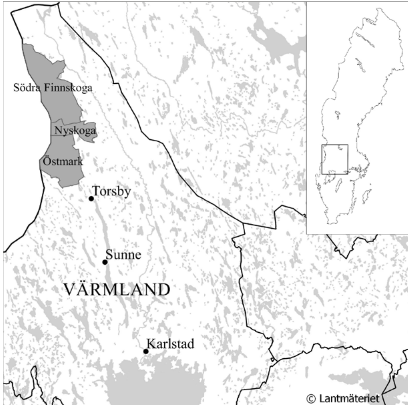
Map 2. In the middle of the 20 th century, Värmland Finnish was still spoken in the parishes of Södra Finnskoga, Nyskoga, and Östmark in the northwestern part of Värmland. The Värmland Finnish material presented in this article has been recorded in these parishes.