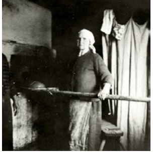
Maizes cepšana Meikula Jarošenko mājās L. Tjapši, Pildas pag., Foto: A. Sang, 1936 ERM 756:19

Figure 8. Introduction to the section on Lielie Tjapši village with historical images of this Lutsi village and its inhabitants.