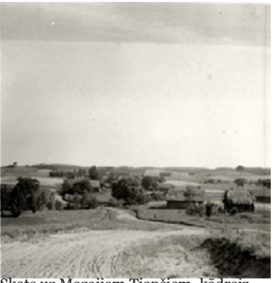
Skats uz Mazajiem Tjapšiem, kādreiz bijis igauņu ciems, tagad pārlatviskots Pildas pag., Foto: A. Sang, 1936 ERM 756:61