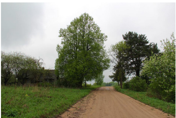
Nikonovu ģimenes mājas Lielo Tjapšu ciemā.