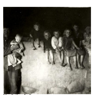
Vecā tipa krāsns Mazie Tjapši?, Pildas pag., Foto: A. Sang, 1936, ERM 756:53