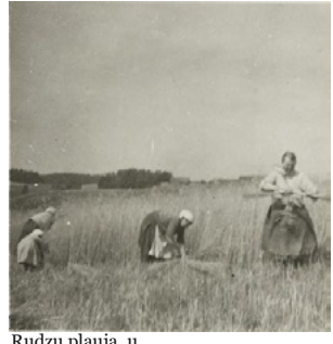
Rudzu pļauja. u L. Tjapši, Pildas pag., Foto: A. Sang, 1936, ERM 756:83