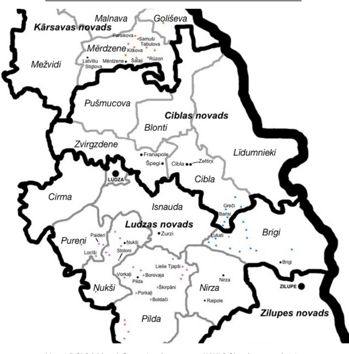
Maps 1 (left) & 2 (above). Comparison between pre-WWII (left) and current administrative divisions (above) in the Lutsi region. (Top-level administrative division names shown in bold italics, lower-level pagasts division names shown in plain italics, towns significant to the Lutsis are shown on the map with/without names. Smaller dots on Map 2 mark Lutsi villages.) Maps by Uldis Balodis (utilizing information from Turlajs 2012: 46–47, 74–75 and RAPLM/PRD 2007).